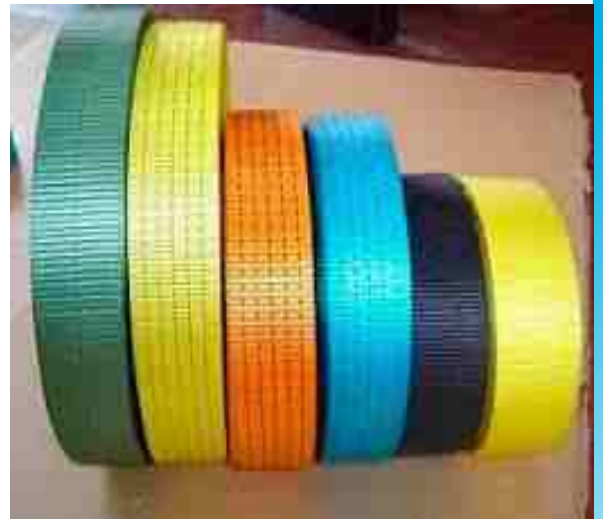
POLYESTER LASHING BELT